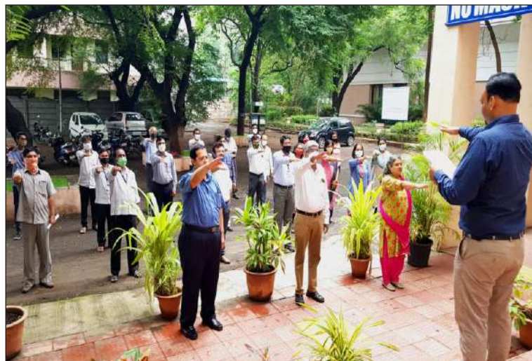
Swacchta Pledge by IMS Faculty & Staff