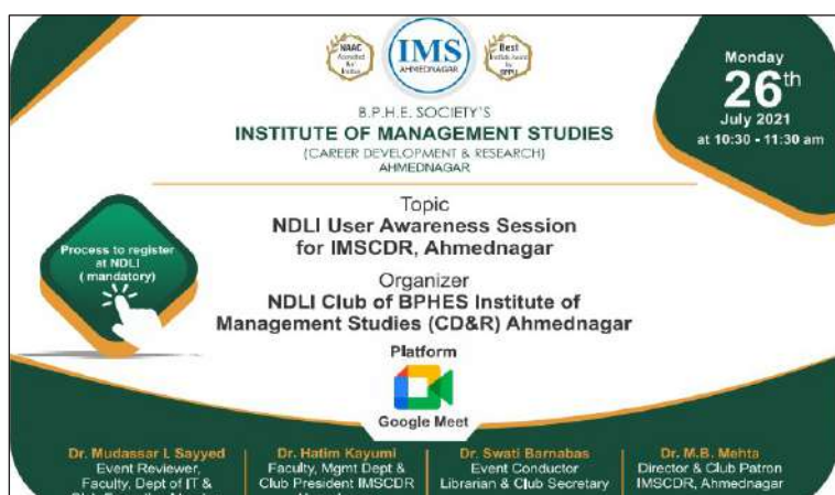
NDLI E - Flyer - User Awareness Session