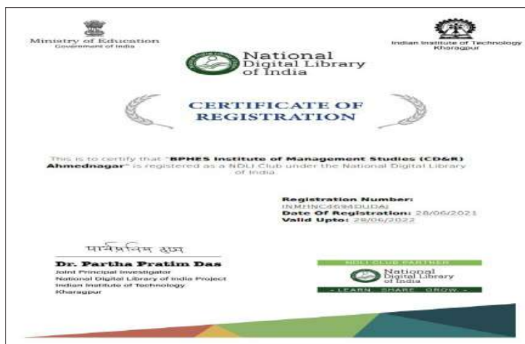
NDLI Club Registration Certificate