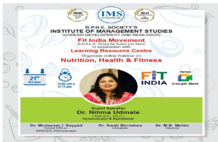
Nutrition, Health and Fitness E - Flyer