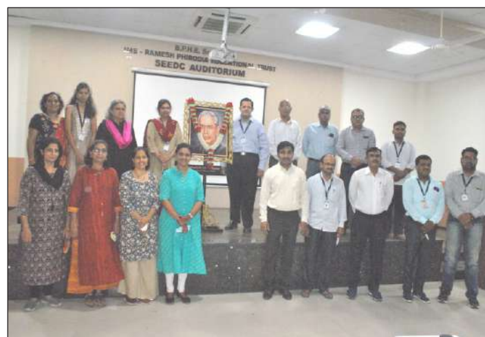
Librarian's Day Celebration